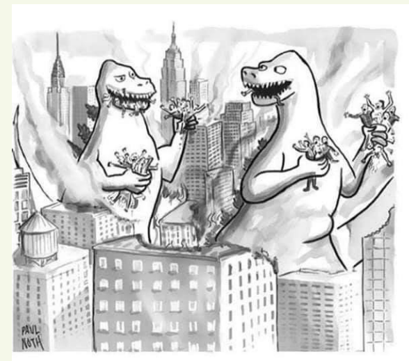
"Of course you feel great. These things are loaded with antidepressants."

Please stay safe, at home as much as possible, maintain social distancing when outside and help save lives.